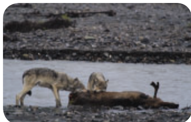
Figure 4 These wolves are feeding on a moose they have hunted.

prey: an animal that is hunted by a predator